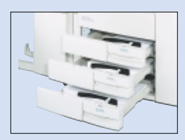
Three 500-sheet adjustable paper cassettes provide paper size flexibility for true versatility.